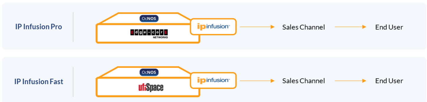
Figure 2. IP Infusion Pro and Fast Service Programs

This one-stop-shopping experience simplifies procurement, reduces complexity, and minimizes risks, allowing you to focus on accelerating innovation and delivering exceptional services to your clients.