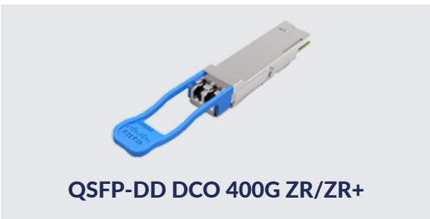
QSFP-DD DCO 400G ZR/ZR+