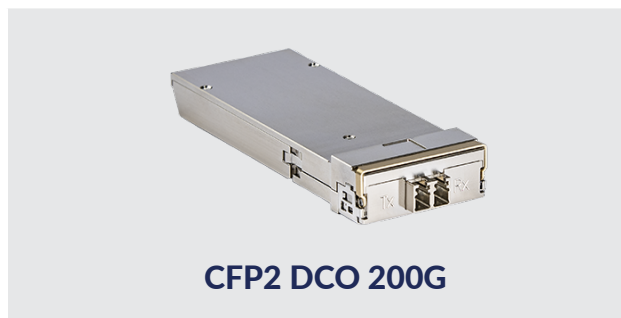
CFP2 DCO 200G

Coherent Optical Communication is the mainstream technology that is used for long distance optical transmission. Coherent optics for commonly packaged CFP2 or QSFP-DD form factors are shown below.